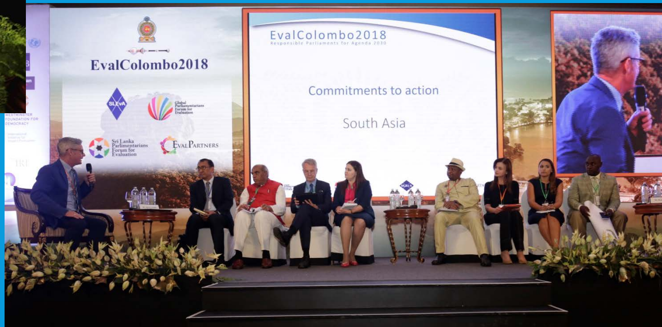
EvalColombo2018 – Global Conference