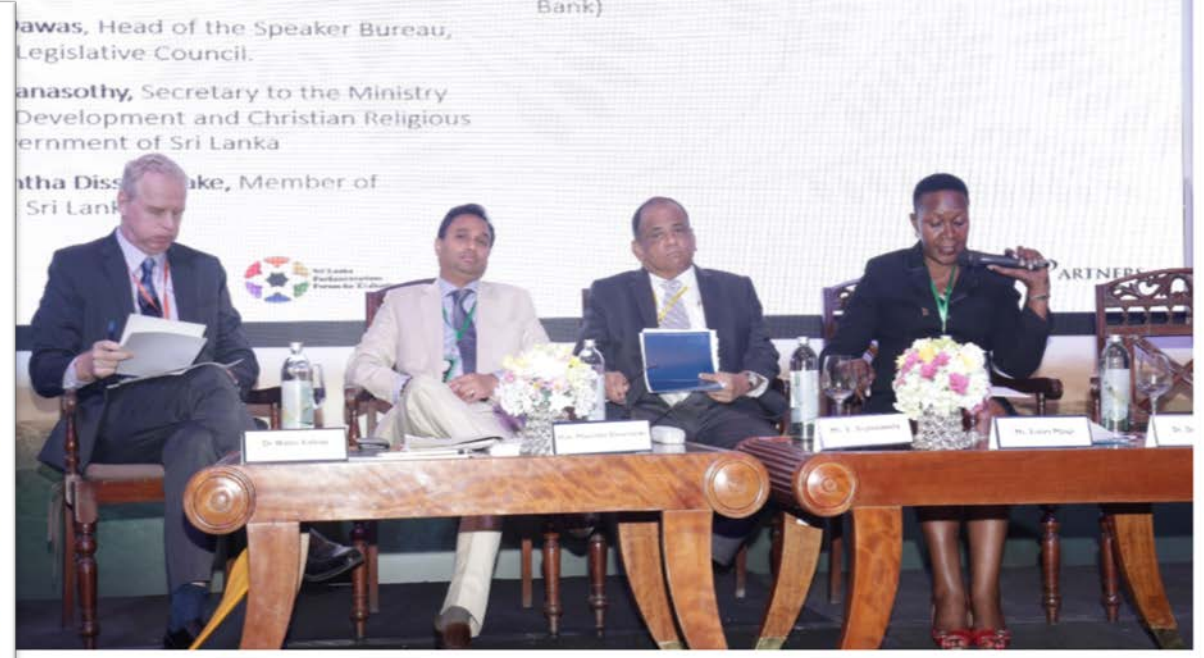
2 nd APEA Evaluation Conference – Sri Lankan Delegation