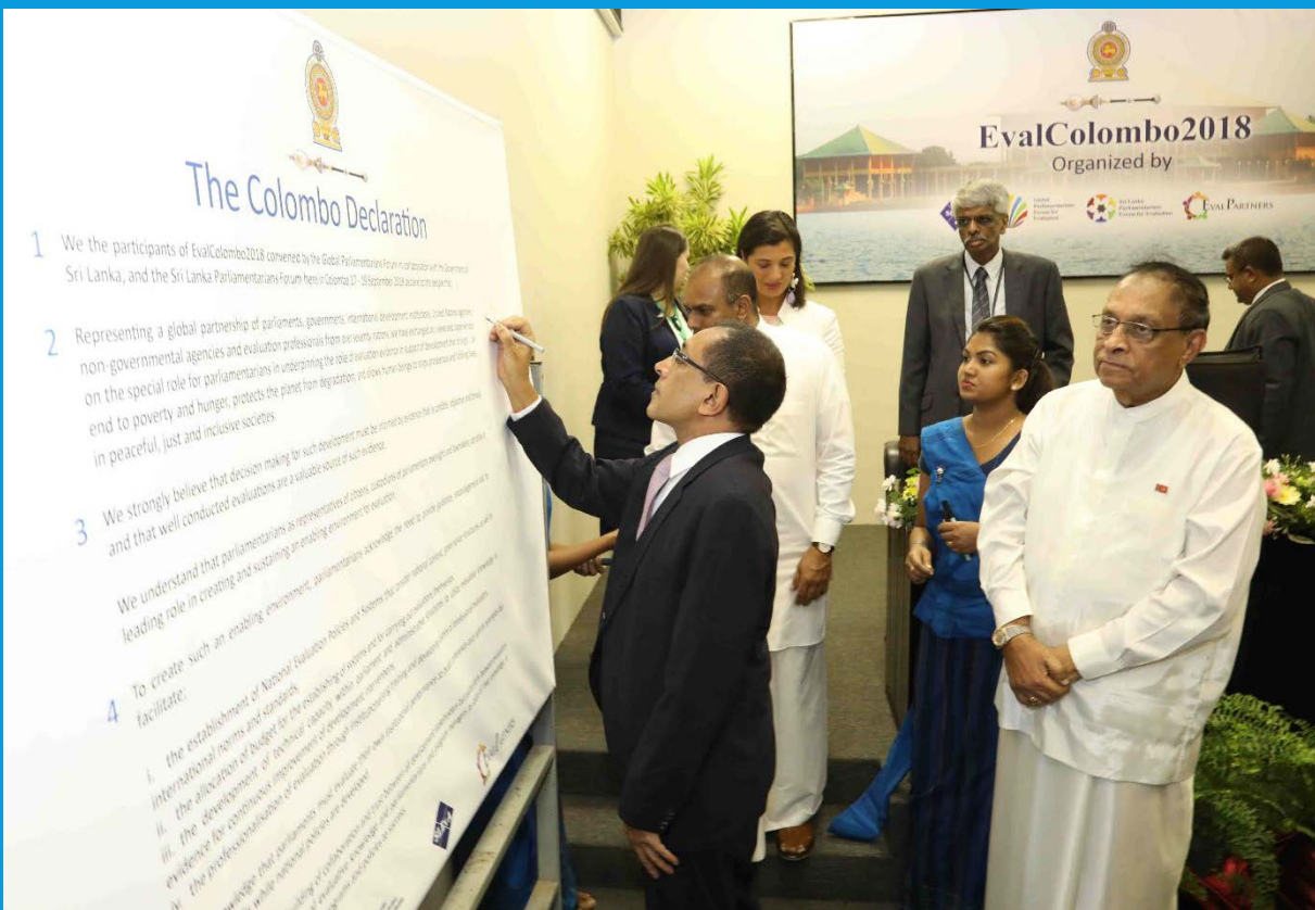
Signing of Colombo Declaration at EvalColombo2018